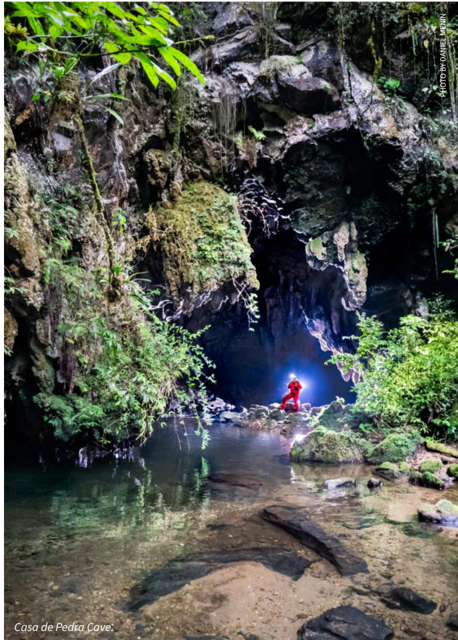
Casa de Pedra Cave.